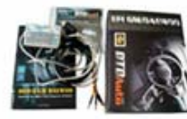
OBD-I GM Scanner